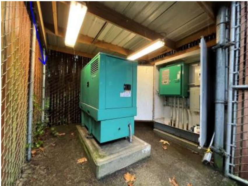
PS 10 – Generator Enclosure